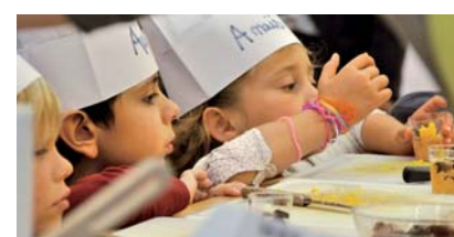
Figure: Change in liking scores among fourth- and fifth-grade children over 10 tastings

Note. Numbers on the horizontal axes correspond to the number of tastings. Group 1: "Dislikers" at the first tasting and Group 2: "Likers" at the first tasting.